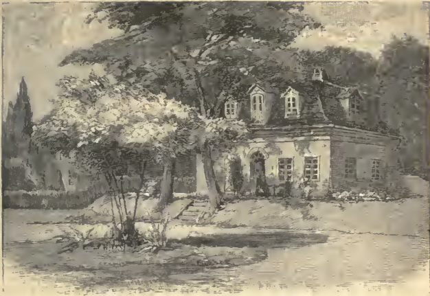
The House in the Garden at Gotha